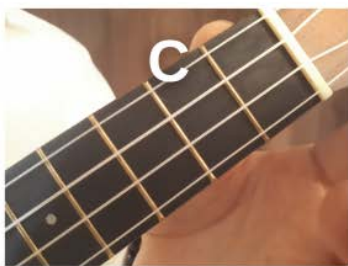
3rd string open