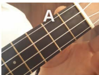
1st string open