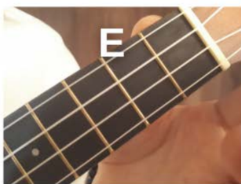
2nd string open